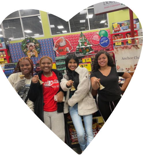
The Jeffersonville High School Anchor Club rang the bell with the Salvation Army.

Our Anchors have been spreading Anchor sunshine all over the country. Here are just a few. Remember, if you would like your club featured please send your updates to youthdevelopment@pilothonq.org