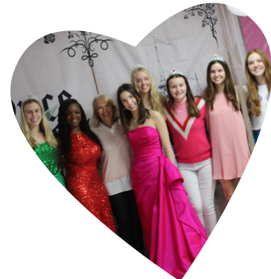
Starkville Academy Anchor had their annual Daddy/Daughter dance with over 200 participants. All proceeded went to their local food pantry.