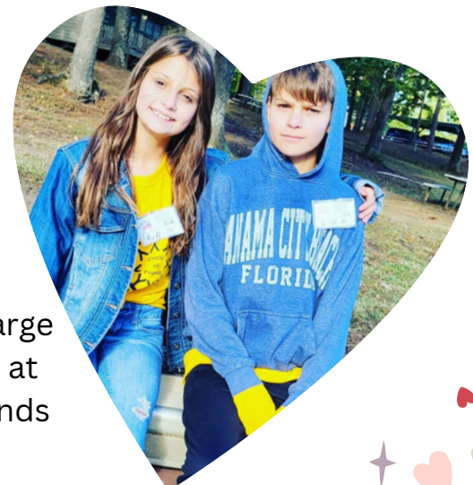
Mineola's Anchors at Large volunteered at Circle of Friends TBI camp.